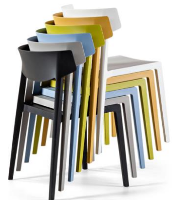
Easy-clean Infection Control Seating